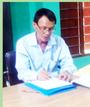
Vice- Chairman Examination Committee