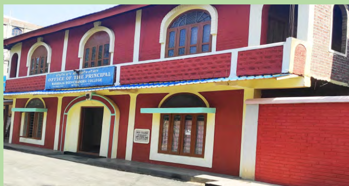
Newly renovated Administrative/ Academic Building