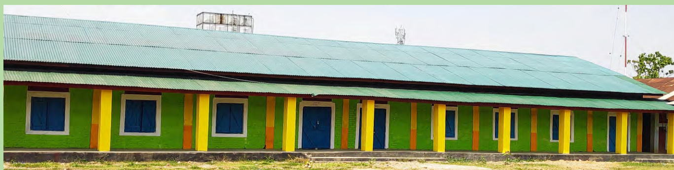
Newly renovated classrooms under RUSA I