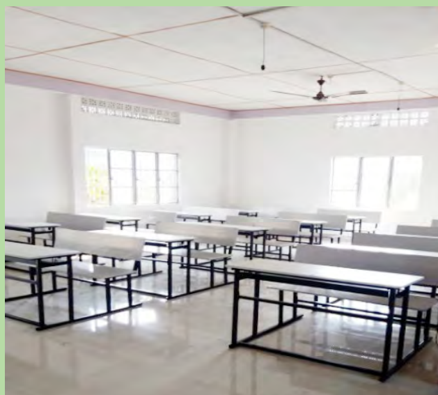
Library reading room & Mini hall