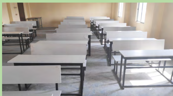
1 st Semester Classroom with new furniture under RUSA I.