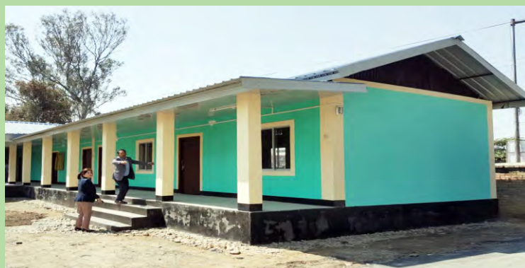
Newly constructed faculty rooms under RUSA I