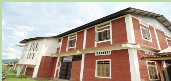
Newly renovated classrooms and Central Library.