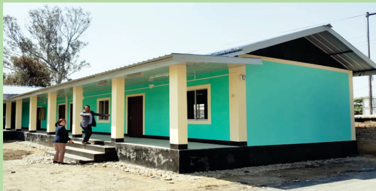
Newly constructed faculty rooms under RUSA I