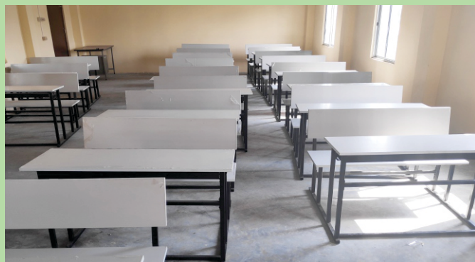
1 st Semester Classroom with new furniture under RUSA I.