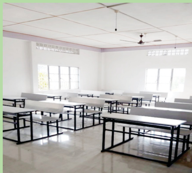
Library reading room & Mini hall