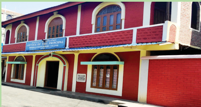
Newly renovated Administrative/ Academic Building