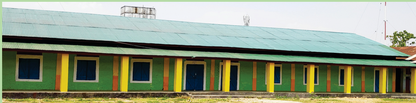
Newly renovated classrooms under RUSA I