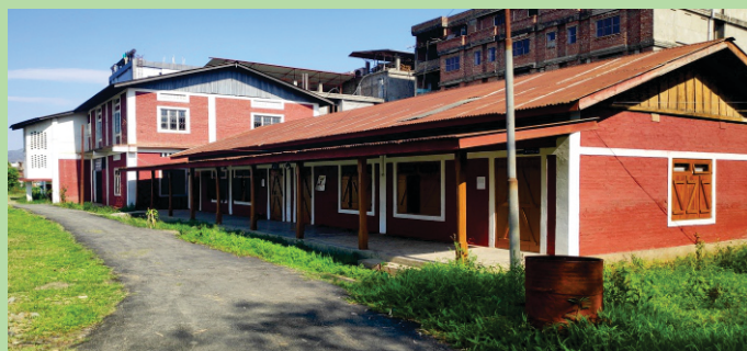
Newly renovated classrooms and Central Library.