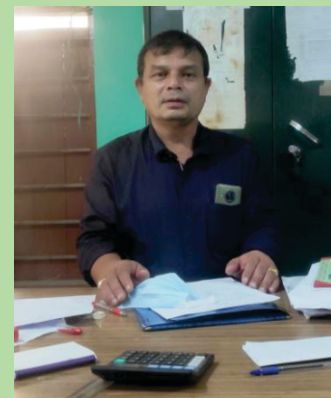
Vice- Chairman Examination Committee